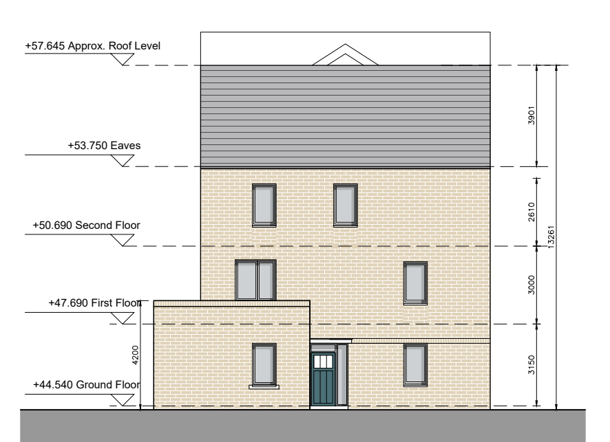
DUPLEX BLOCK E SIDE ELEVATION (NORTH)