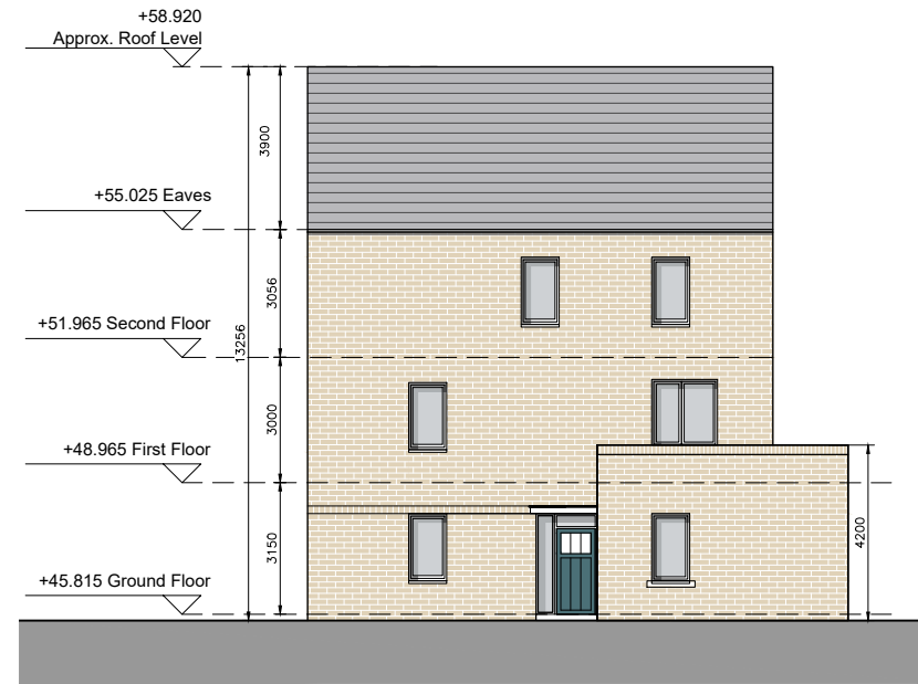
DUPLEX BLOCK E SIDE ELEVATION (SOUTH)